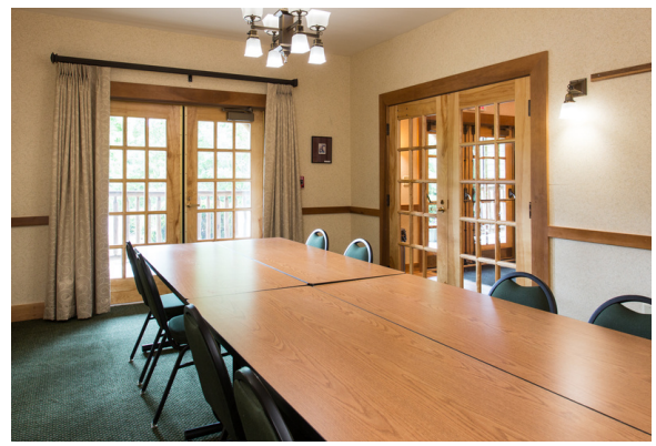
*Additional lodging facilities available for an additional fee.